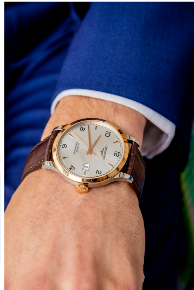
TROUSERS: Moss RRP £80 Outlet £60, JACKET: Moss RRP £259 Outlet £209, TIE: Moss RRP £29.95 Outlet £24.95, SHIRT: Moss RRP £49.95 Outlet £39.95 SHOES: Kurt Geiger RRP £119 Outlet £89, WATCH: Hour Passion RRP £2,850 Outlet £1,995. Available at Cheshire Oaks Designer Outlet